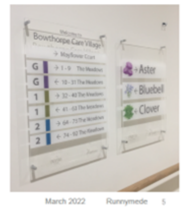
Aim: High quality onsite support promoting independence, tackling isolation, and maximising resident's health and wellbeing

as and along any ne without creater s can work well and frames are purchased biores of interest or